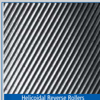
Helicoidal Reverse Rollers