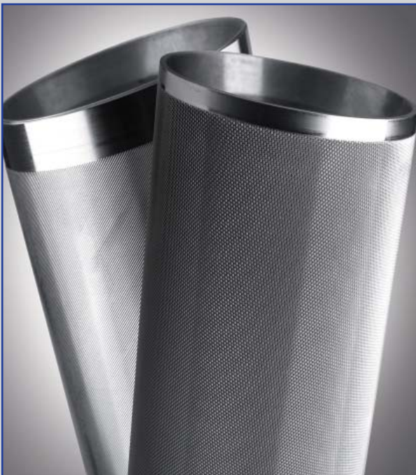
Printing Rollers Coating Rollers